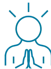
Peace of Mind